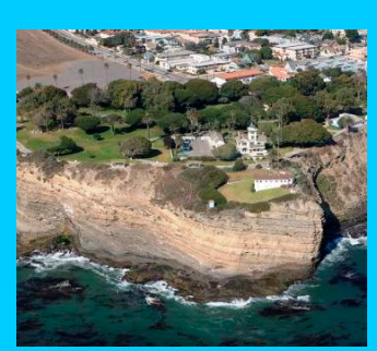
Channel Webcam from Point Fermin