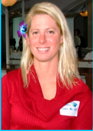
Surface Water Temps