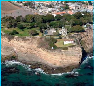
Channel Webcam from Point Fermin