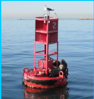
San Pedro Buoy 46222