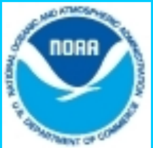
SoCal Marine Forecast