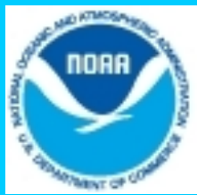
SoCal Marine Forecast