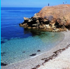
Weather on Catalina Island