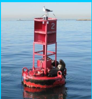
San Pedro Buoy 46222