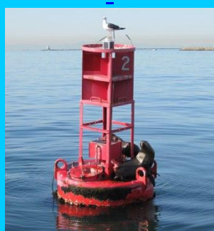
San Pedro Buoy 46222

Barbara Channel Swimming Association have partnered to train our official observers, which includes an annual review of observer responsibilities.