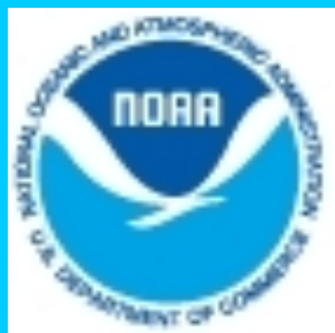
SoCal Marine Forecast