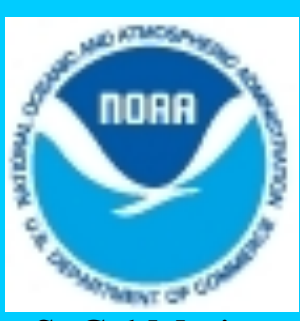
SoCal Marine Forecast