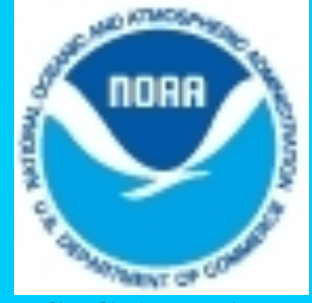
SoCal Marine Forecast