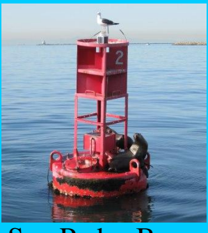
San Pedro Buoy 46222