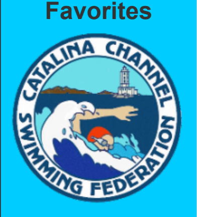
Swim Catalina Serving Since 1981