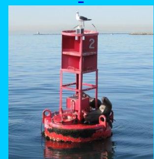
San Pedro Buoy 46222