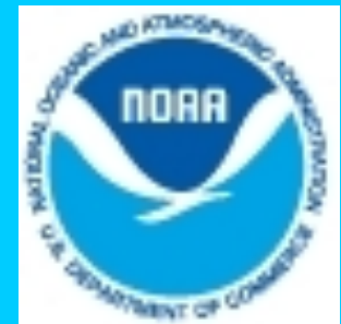
SoCal Marine Forecast