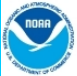
SoCal Marine Forecast