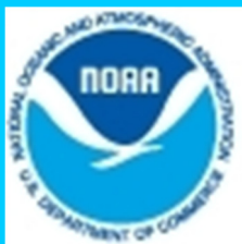
SoCal Marine Forecast