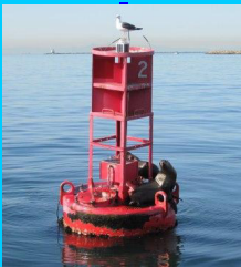
San Pedro Buoy 46222