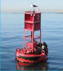
San Pedro Buoy 46