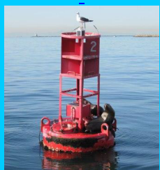
San Pedro Buoy 46222