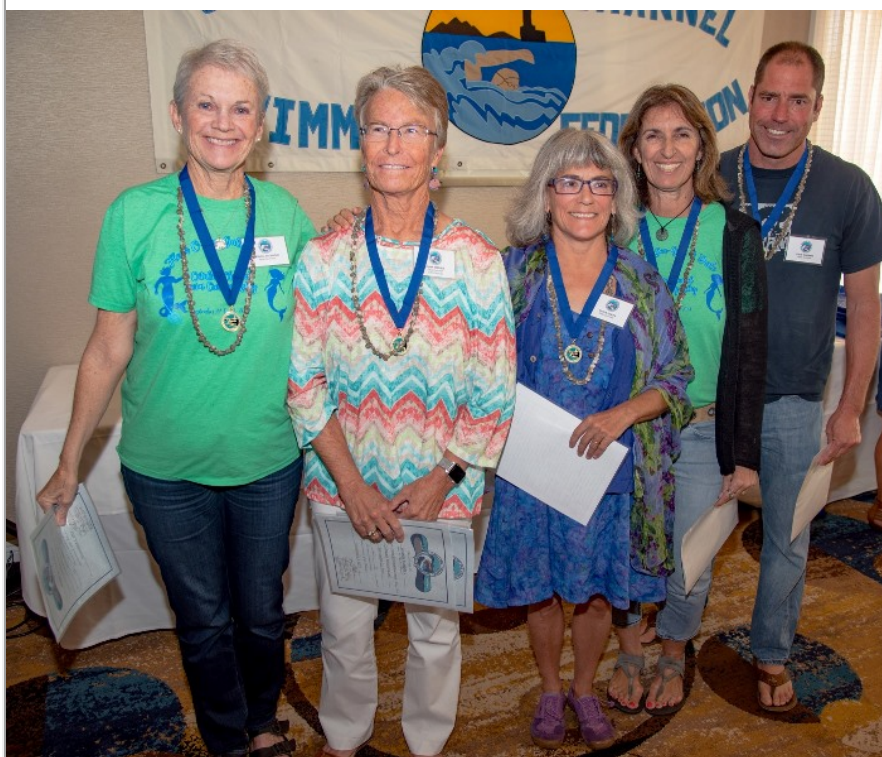
Successful relay team Flock o' Seagals & Dude