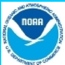
SoCal Marine Forecast