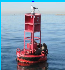
San Pedro Buoy 46222