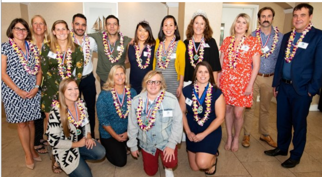
Class of 2019 solo swimmers attending the CCSF awards banquet

The Carnegie Hero Fund Commission recognizes "civilians who voluntarily risk their life to an extraordinary degree while saving or attempting to save the life of another person." Honorees receive the CARNEGIE MEDAL and become "eligible for financial considerations." Pretty sweet.