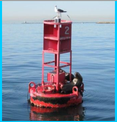
San Pedro Buoy 46222