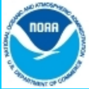
SoCal Marine Forecast