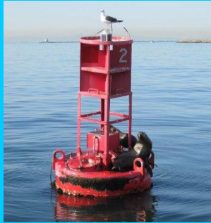
San Pedro Buoy 46222

The CCSF will host two observer training sessions in Southern California Saturday May 13 in Los Angeles (San Pedro).