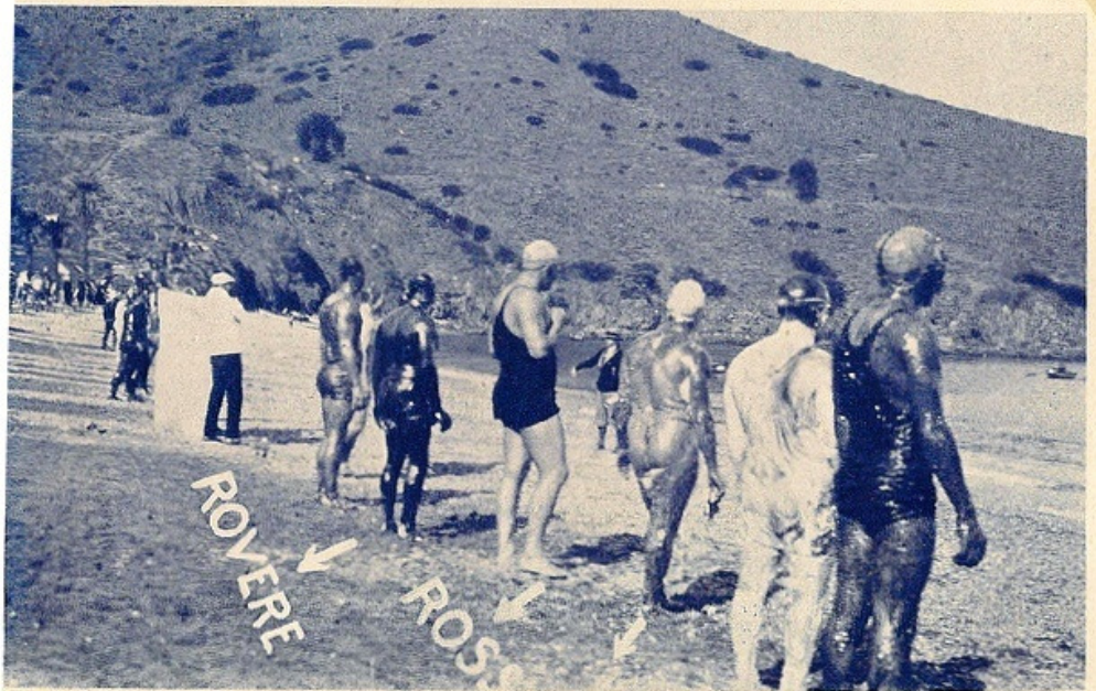
Start of Catalina Swim