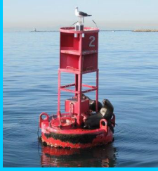
San Pedro Buoy 46222