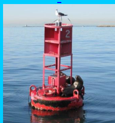
San Pedro Buoy 462