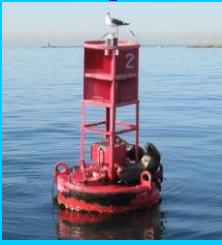
San Pedro Buoy 46222